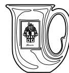
Souvenir “Morris” Crested Horn Mug

Visit Wendy’s Corner Cabinet located in the foyer.